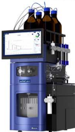
5.125 Complex purifications with confidence 250 ml/min @ max. 125 bar