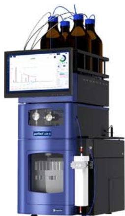
5.007 Process - Kilo-Lab 750 ml/min @ max. 7 bar