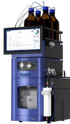
5.050 Cross-over Flash /Prep 250 ml/min @ max. 50 bar