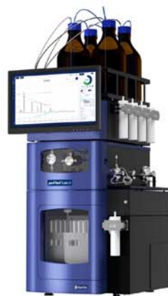
5.020-5X Lab-Productivity 300 ml/min @ max. 20 bar