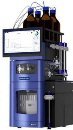
5.250P Peptides complex mixtures 125 ml/min @ max. 250 bar