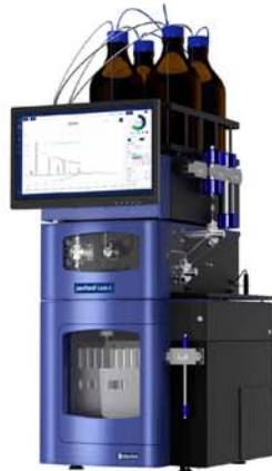
5.125P The peptides specialist 250 ml/min @ max. 125 bar