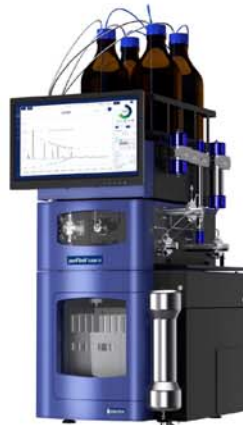
5.250 very Small, Hyper Powerful 250 ml/min @ max. 250 bar