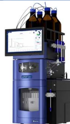
5.400 The Ultra-Purification 125 ml/min @ max. 400 bar