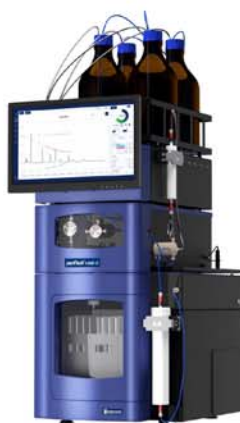
5.020 The partner of daily challenges 300 ml/min @ max. 20 bar