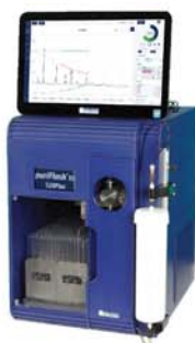
XS 520Plus very Small, very Powerful very Awesome 300 ml/min @ max. 20 bar